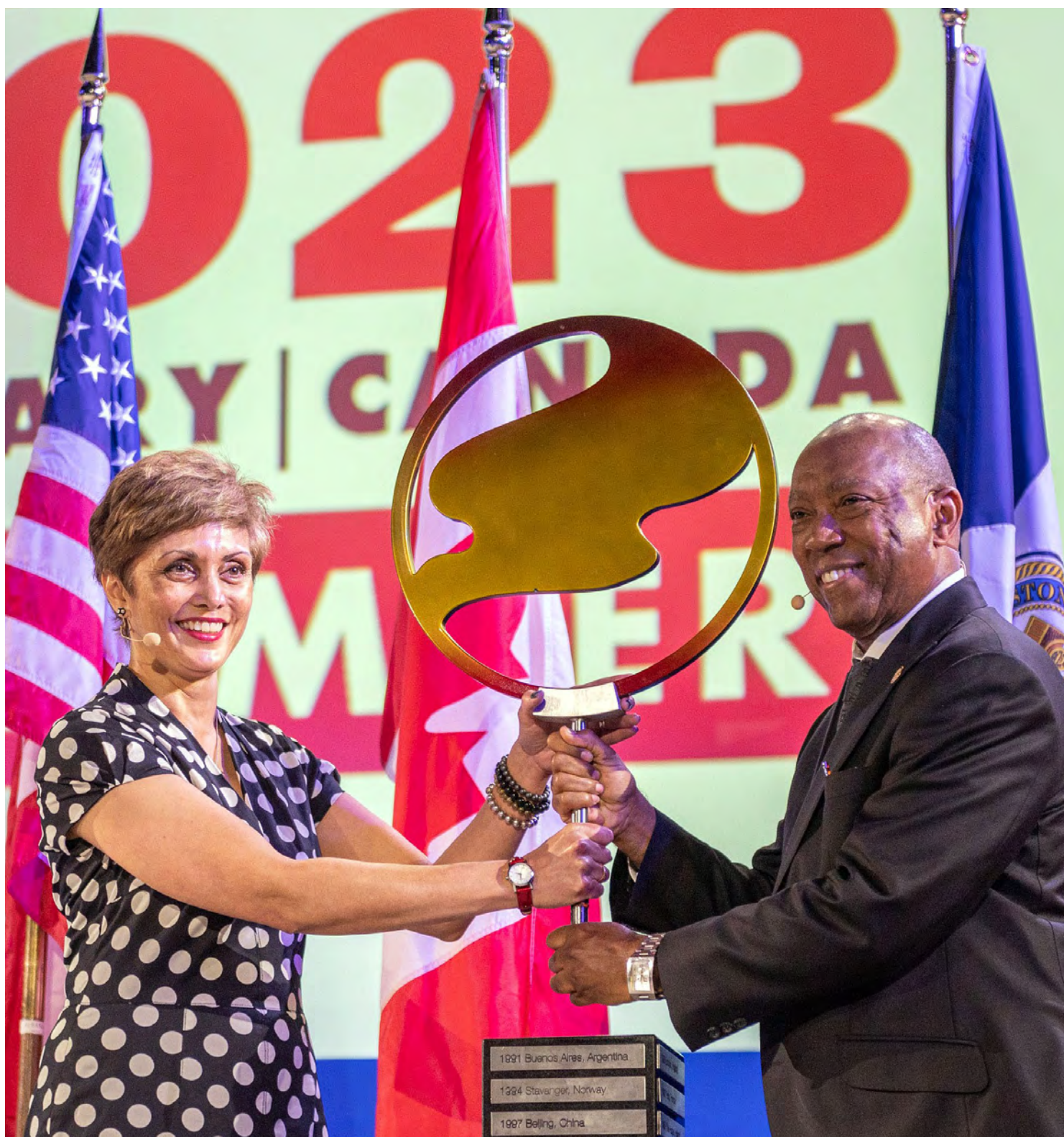
Honorable Mayor of Calgary Jyoti Gondek (left) and Honorable Mayor of Houston Sylvester Turner (right) during the 23 rd WPC Closing ceremony