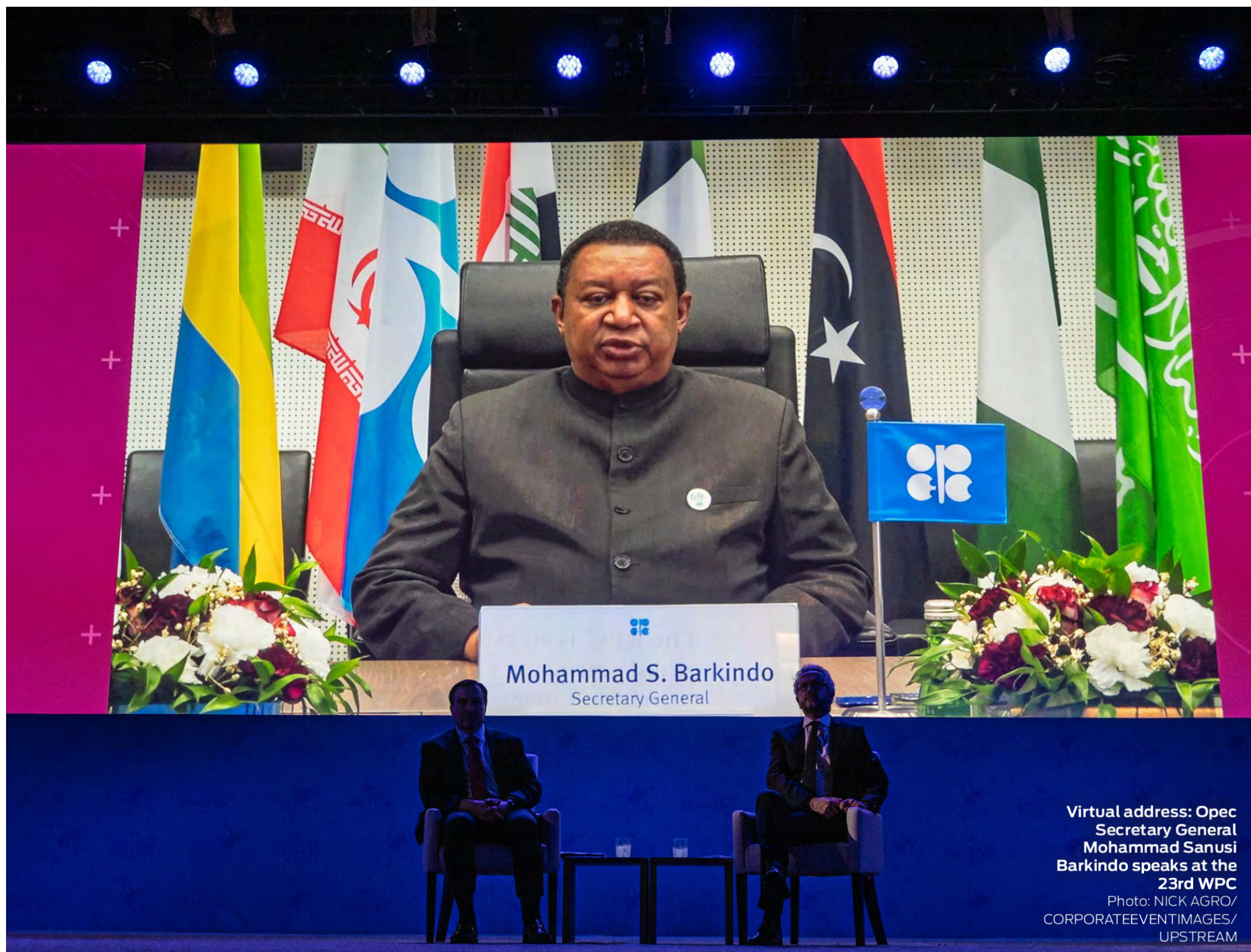
Virtual address: Opec Secretary General Mohammad Sanusi Barkindo speaks at the 23rd WPC