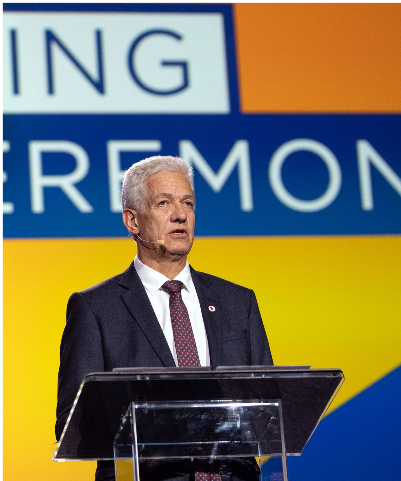
Closing remarks: outgoing President of the World Petroleum Council Tor Fjaeran

More traditional oil and gas themes were highlighted as well, including