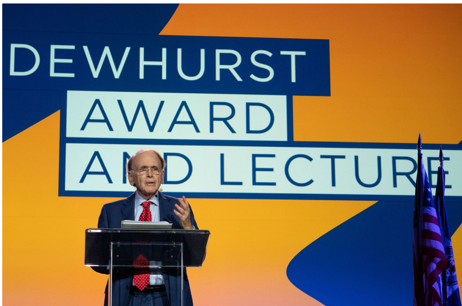
Dr Daniel Yergin delivers his lecture after being awarded the prestigious Dewhurst Award at the 23rd WPC